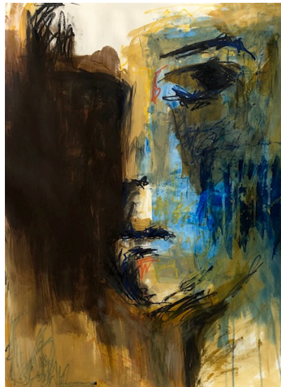
NATURAL FORCE Mixed Media on Paper 30'' x 22''