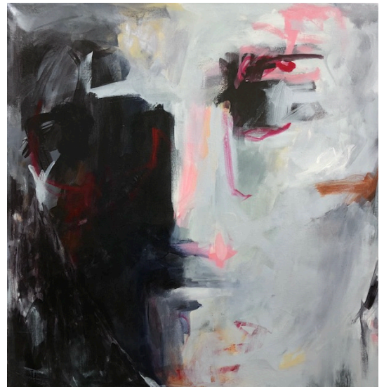
SHE TOLD ME Mixed Media on Canvas 36' x 36''