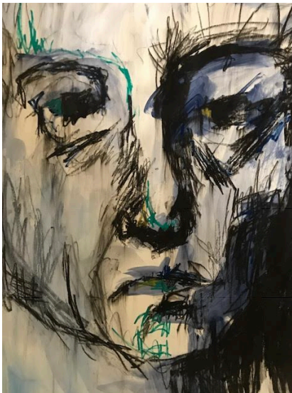
MY HAND Mixed Media on Paper 30'' x 22''